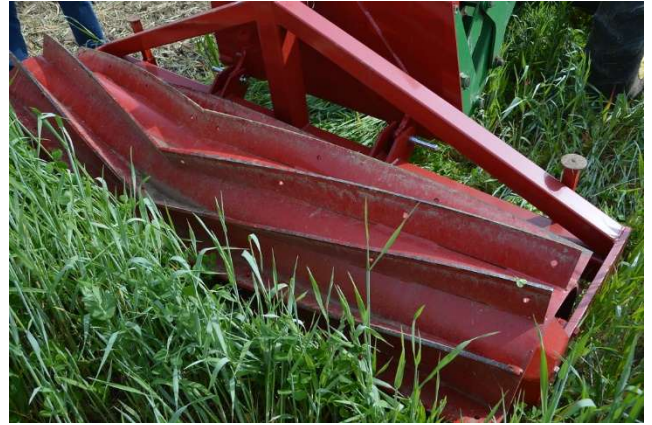
Figure 1. Roller crimper implement.

Roller crimping is a common practice in other parts of the country but had not yet been studied in California orchard systems. A roller crimper is a drum-shaped implement with blunt curved blades (Figure 1.) that rolls over and crushes down the vegetation without disturbing the roots. This creates a mat of biomass over the soil's surface, similar to mulch. This has been shown to reduce soil temperatures, conserve soil moisture, decrease erosion, and reduce herbicide use. The timing of roller crimping is critical; too early and you won't have enough biomass produced to adequately cover the soil and provide the desired benefits. Too late and the cover crop may have produced seed that can germinate in the current season, depending on irrigation practices and precipitation.