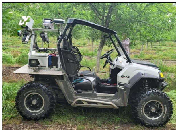
Figure 1. Dropcopter's Green Atlas Cartographer in a prune orchard.

Prune growers are faced with difficult thinning decisions annually. An accurate understanding of the crop load of the trees is critical in choosing whether and how much to thin to maximize the potential quality of the fruit at harvest. However, orchards can be highly variable based on soil types, proximity to water sources like canals or neighboring rice fields, and the history of the field. Tools like Dropcopter's crop scanning services can help growers understand variability in the field as well as gain a better understanding of the total yield expected. Additionally, processors can utilize the technology later in the summer to get a more accurate estimate of the crop that will be coming into the dryer, making labor and logistical planning easier.