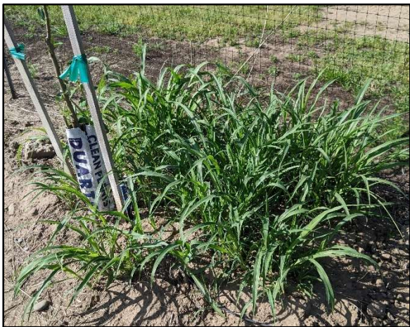
Glyphosate only (2 pt/A)