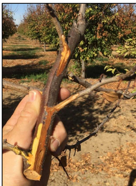
Figure 2. Cytospora canker infections spread most rapidly in severely water stressed (sustained lower than -20 bars SWP) orchards. High to severe water stress is more likely to occur in late August and early September during and after harvest.