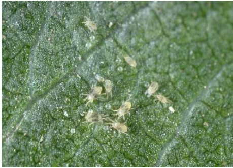
Fig. 1. Twospotted spider mites

Spider mites are one of the pests that can become a problem in prunes. Two-spotted spider mite and Pacific spider mite are commonly found in prunes in the Central Valley. Of the two species, the two-spotted spider mite is the predominant species in the Sacramento Valley, whereas the Pacific spider mite is more common in the San Joaquin Valley.