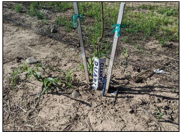
Glyphosate + Rimsulfuron (4 oz/A)