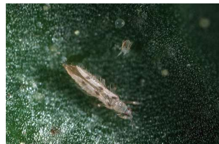
Fig.2. Two common spider mite predator species: western predatory mite (top) and sixspotted thrips adult (bottom)