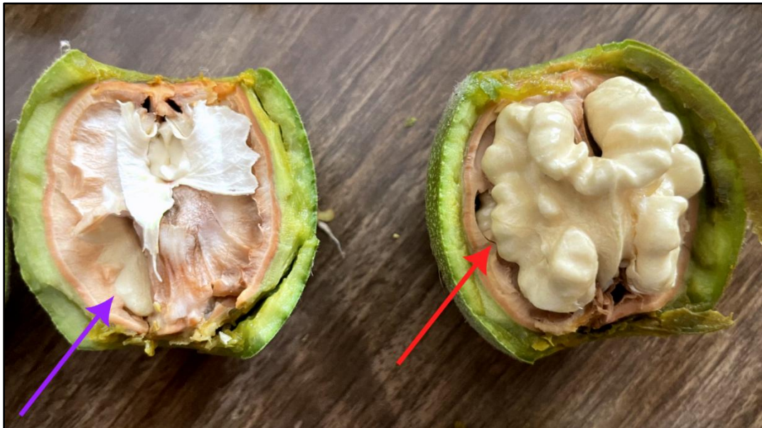
Purple arrow indicating where kernel still attached to packing tissue on immature nut, left; red arrow indicating the kernel detached from the packing tissue close to maturity, right.