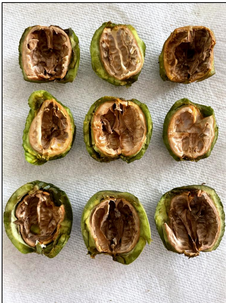
More examples of packing tissue brown.

Ethephon is a compound that accelerates separation of the walnut hull from the shell. This enables harvest at an earlier time after PTB, when the kernels are at highest quality.