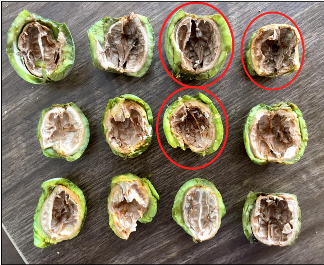
Examples of mature nuts at packing tissue brown (PTB), circled, and immature nuts.