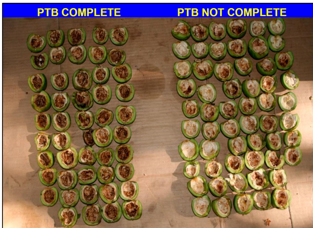
Examples of mature nuts at packing tissue brown (PTB), left, and immature nuts, right.

The point at which walnut kernels are mature, lightest in color, and of highest value is reached when packing tissue between kernel halves has just turned brown, commonly referred to as "packing tissue brown" or PTB. Climate greatly influences this – there is less time between PTB and the time when hulls have separated from the shell in cooler, coastal areas than there is in the hotter and drier valley regions.