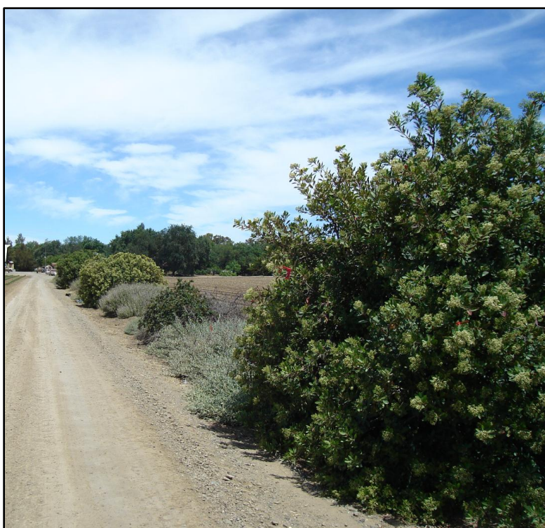
Figure 2. Example of an established native hedgerow along a field border

1 Long RF, Valliere JM. Established native hedgerows on field borders suppress weeds on farms. Weed Science . Published online 2025:1-20. doi:10.1017/wsc.2025.2