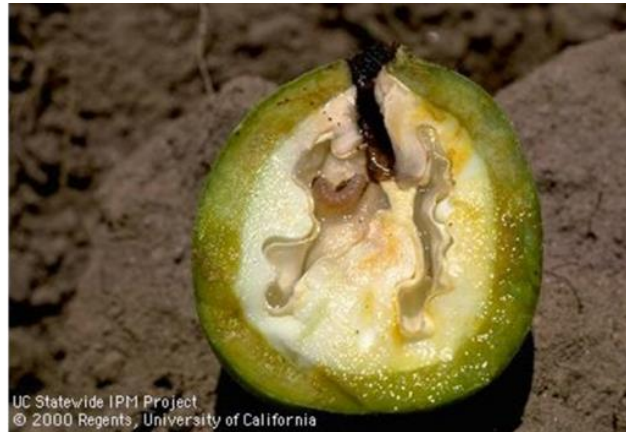
Left: Navel orangeworm damage. Right: Codling moth damage.