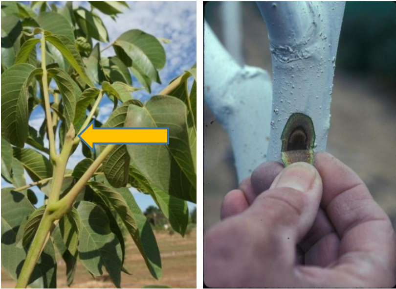
Left: Withhold irrigation until a terminal vegetative bud sets on the trunk. Right: After a severe freeze event cut into the southwest-facing trunk, looking for dark brown discoloration of the cambium.