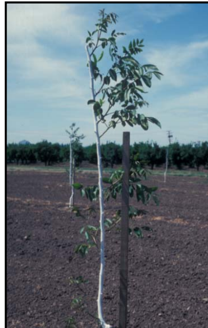
Figure 2. 1-year old Chandler painted white after December 1990 freeze. Damage (no upper shoots) on southwest side of tree. Photo, 5/91 by J. Hasey.