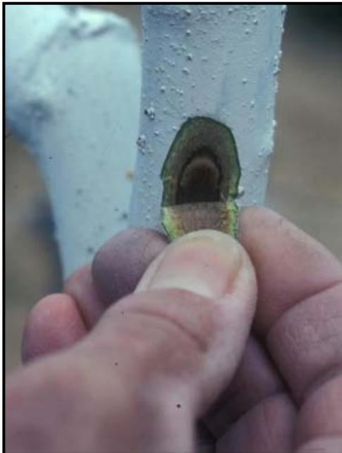
Figure 1. Walnut freeze damaged wood is discolored and dry.

If you suspect cold damage, do NOT prune out the damaged limbs. Buds may be slow in opening or buds from deep in the bark may grow to rejuvenate the limb. In the late summer, prune out dead wood that did not revive. New scaffolds that grew can be trained to replace the damaged wood. Reduce or delay spring fertilizer applications where cold damage is evident.