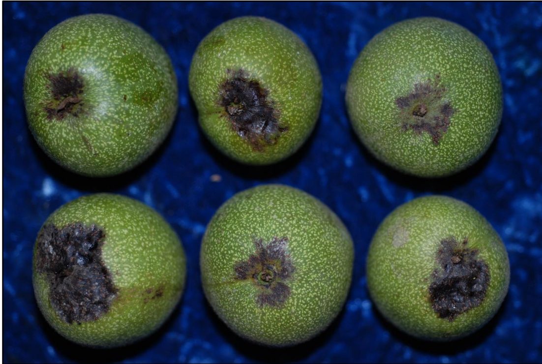
Photo 2. Brown Apical Necrosis (BAN) mold infections in Ivanhoe.

As the fungal infection expands under the hull, the hull is decayed and the infection spreads to the kernel, most likely through the apical end. It stands to reason that improved walnut blight management, particularly of secondary infections, will lead to less BAN although this has not yet been studied. More on walnut blight best management practices at: sacvalleyorchards.com/walnuts/diseases/walnut-blight-management/