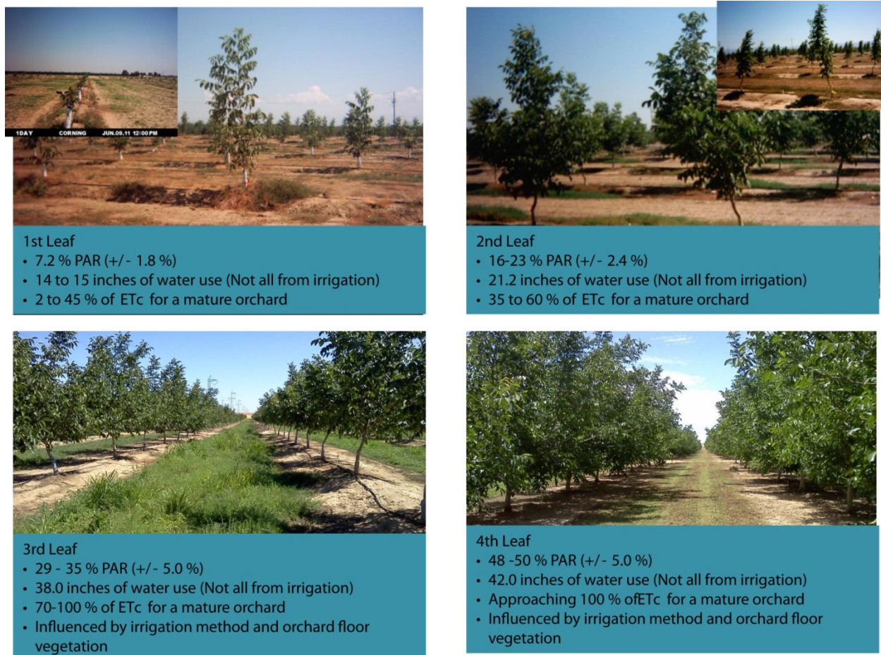
Figure 1. Water use estimates for first, second, third and fourth leaf walnut trees. PAR is a measure of sunlight interception. PAR stands for Photosynthetically Active Radiation.